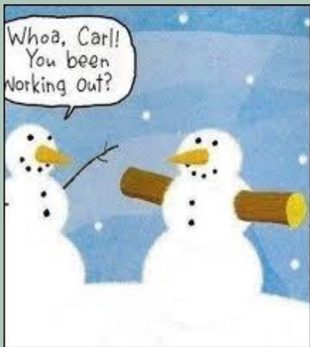
Funny Pictures on www.lefunny.net

See a retirement planner this winter. A small amount of money now will grow huge by retirement age (you can put up to $5500 dollars a year in an IRA). If you are 25 and put $2500 dollars a year in an IRA for 5 years straight and do not touch it until you are 65, you will have $96,000 at 6% growth. https://www.tsp.gov/PlanningTools/Calculators/howSavingsGrow.html